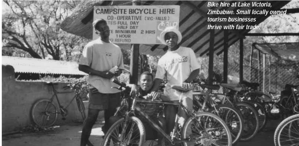
Bike hire at Lake Victoria, Zimbabwe. Small locally owned tourism businesses thrive with fair trade.

Established in the 1960s, the Fairtrade Movement was set up as 'a trading partnership based on dialogue, transparency and respect that seeks greater equity in international trade.' Today it is a highly recognizable label on products such as tea, coffee and bananas which tells us that the producer and workers involved get a fair price in a trading system which often cripples the poorest and most vulnerable.