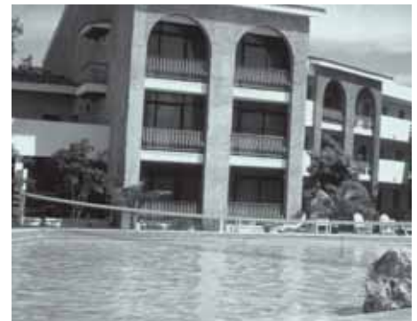
Another inevitable pool at a luxury hotel; and 'golf curse', a protest against golf courses in Goa.

Recommendations about controlling water usage often lie with the tourist and include turning taps off when cleaning teeth and taking fewer showers. But is there more we can do to reduce the amount of water we use? The problems, however, run deeper than this. Is it time for local government, tour operators, hotels and water companies to come up with solutions to this potentially catastrophic problem and ensure that local communities get their fair share?