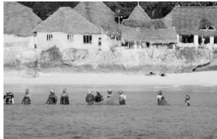
Women fishing in Nungwi, Zanzibar, where the local community still depends heavily on agriculture and fishing. However, near the Gemma Dell Est tourist resort, access to the beach and farmlands has been restricted for locals severely affecting their livelihoods.

action: For more information on our Hilton Campaign, visit our website at: www.tourismconcern.org.uk