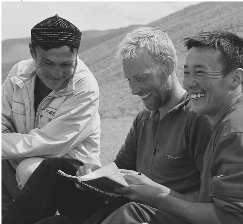
Mongolia 2005: A good volunteering experience – swapping Kazakh and English words.

actions: We very much want our members and supporters to contribute to the direction of Tourism Concern's campaigns. Please do come to our annual general meeting on Saturday 14th October when we will be holding workshops on climate change, water, fair trade, international volunteering and gap years.