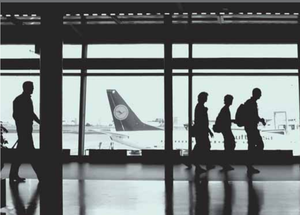
Tourists on their long way to the departure gates