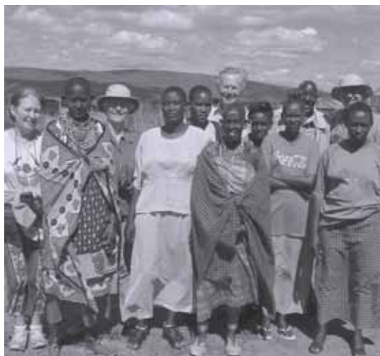
Participants meet with a Maasai pastoralist women's council as part of the trek, learning about their work with women's rights and girls' education.