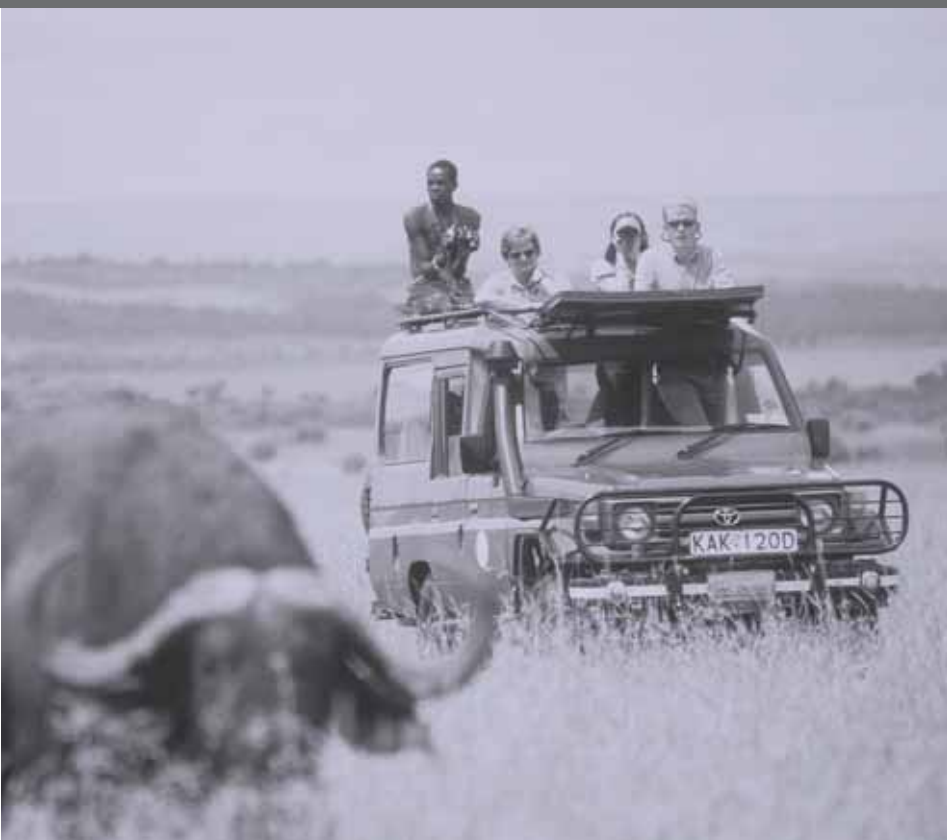
Not a cow in sight!