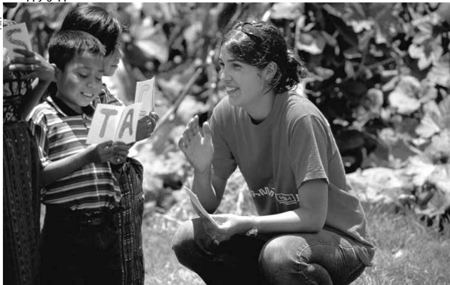
A happy gapper at work.