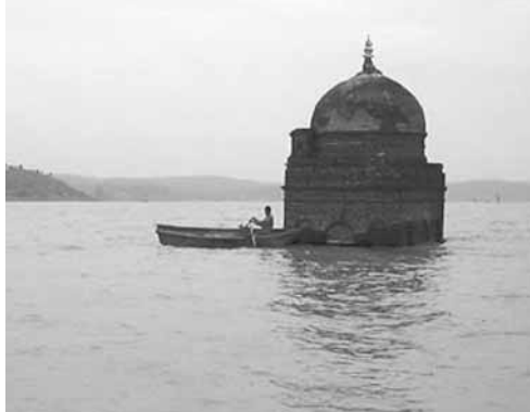
This temple was once part of one of the many villages which have been submerged to make way for the 30 large, 135 medium-sized and 3,000 small dams that are being built in the Narmada Valley in Gujarat, India. One large dam alone is displacing more than 35,000 families.

The building of the dam has already displaced tens of thousands of indigenous people including farmers, very few of whom have